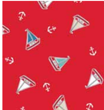
1773/R Tossed Yachts