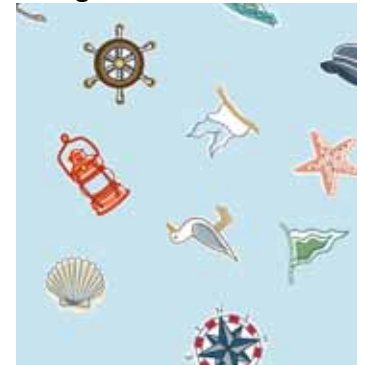
1771/B Icon Scatter