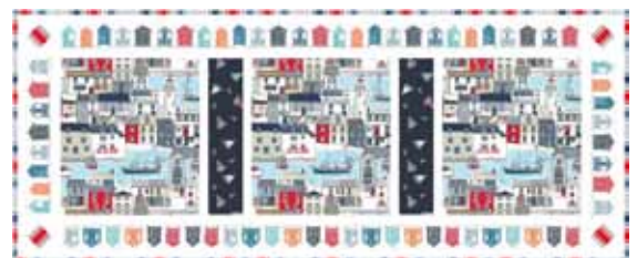
Table Runner & Four Coordinating Placemats

Finished Size of Table Runner 35 x 90cms (14" x 35"), Placemats 35 x 45cms (13" x 18")