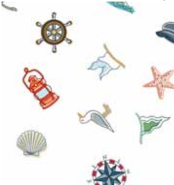
1771/W Icon Scatter