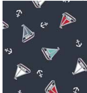
1773/B Tossed Yachts