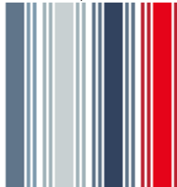
1765/B Multi Stripe