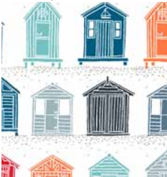
1770/1 Beach Huts